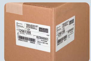
Label application on corrugate