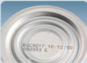
Ink jet on can