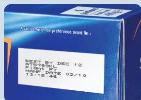
Ink jet on paperboard