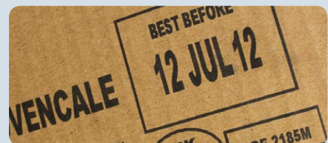
Large character ink jet on corrugate