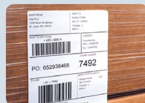
Label application on stretch wrap