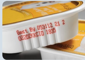
Ink jet on plastic tub