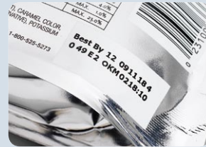
Thermal transfer (TTO) on pouch