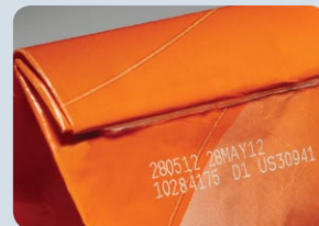
Laser on bag