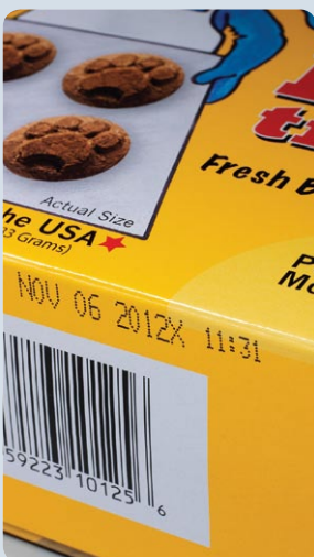
Ink jet on paperboard