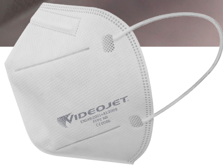
Medical masks (FFP2, FFP3, N95, KN95)