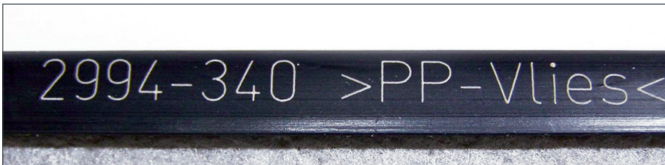
Plastic profile for car upholstery. Material effect: color change. Laser marked with a fiber laser marking system.