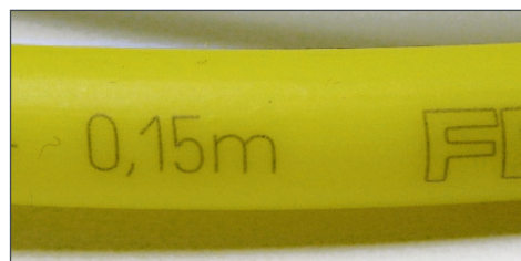
Left: Fuel lines. Material effect: color change. Laser marked with a fiber laser system.