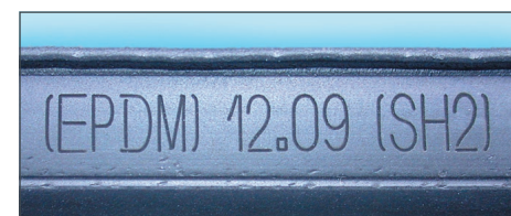
Rubber car door sealing. Material effect: engraving. This part was laser marked with a 30W CO2 laser marker.

... mark nearly all extruded materials with the information companies need to apply - e.g. (bar)codes, logos/ symbols, (serial) numbers and letters.