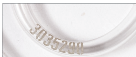
Left: PE tubes. Material effect: engraving. Laser marked with a 50W CO2 laser marker.