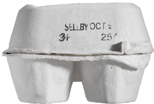
Producer code has been removed for anonymity

Contact marking systems aren't easy to change the information being coded on the carton, and they are difficult to reconfigure if a new layout is required. They also don't indicate when they are running low on ink, or when they might have a printing problem. If employees don't check, consumers will become the quality control point.