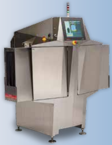
Thermo Scientific Xpert S400 X-Ray Inspection System