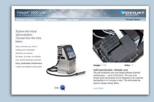
Virtual Product Demos