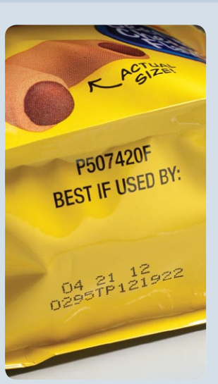
Ink jet on pouch