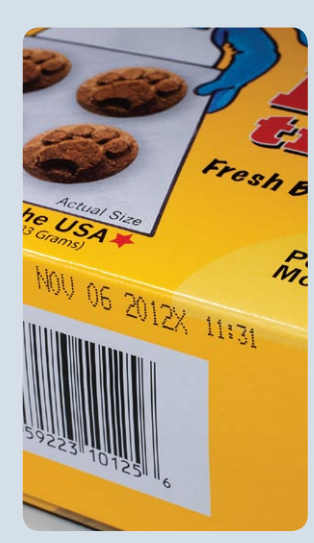
Ink jet on paperboard