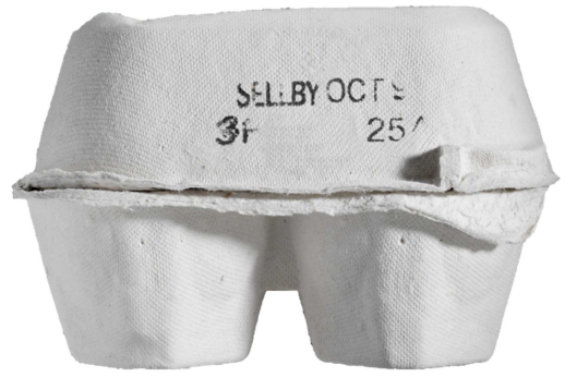
Producer code has been removed for anonymity

coding solutions also produce inconsistent and unprofessional print quality. Keep in mind that the purpose for carton coding is to create an optimal solution for the consumer to judge egg freshness and to be the first line of response in a food recall scenario.