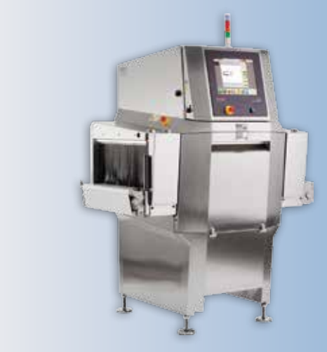
Thermo Scientific Xpert C600 X-Ray Inspection System